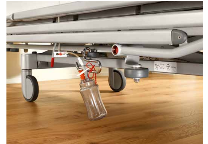
▲ The supply rail offers flexible options for attaching accessories to the bed (optional).