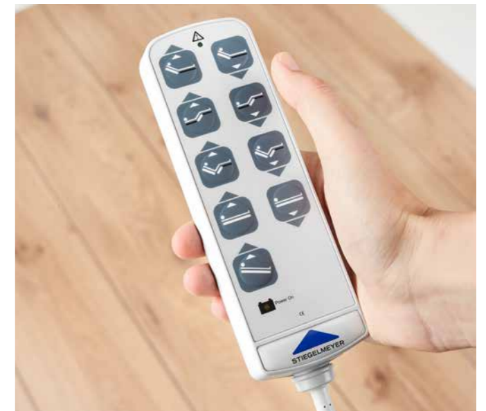
▲ An optional handset is available that can be combined with the control box.