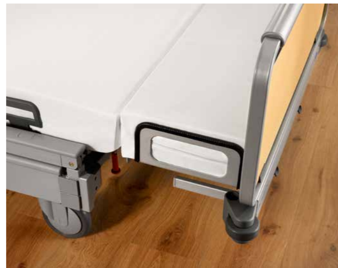
▲ The bed extension allows the mattress base to be extended to a comfortable length for tall patients (optional feature).