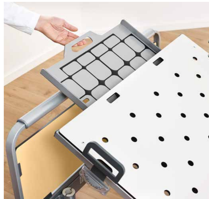
▲ The mattress base can also be equipped with a radiolucent HPL backrest as an optional feature.