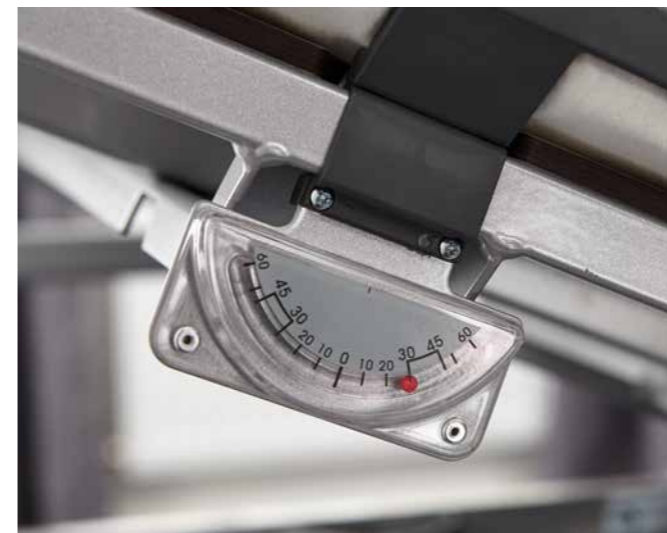
▲ The angle indicator enables the backrest to be tilted precisely to the medically required position (optional).