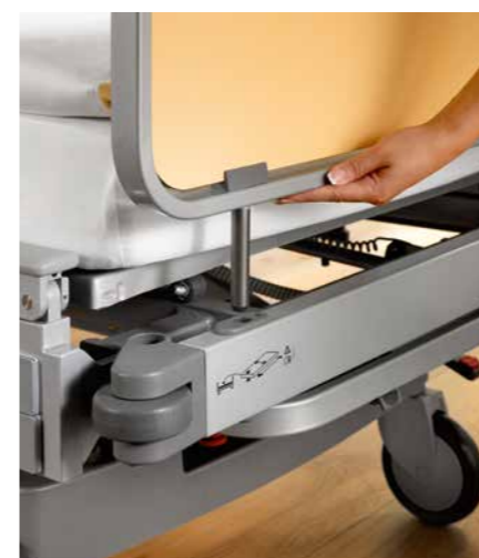
▼ Both models can be quickly and easily removed.