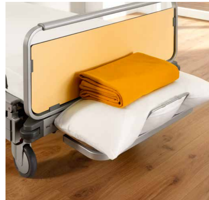
▲ The slide-out linen holder is a practical aid when changing bed linen or treating the patient.