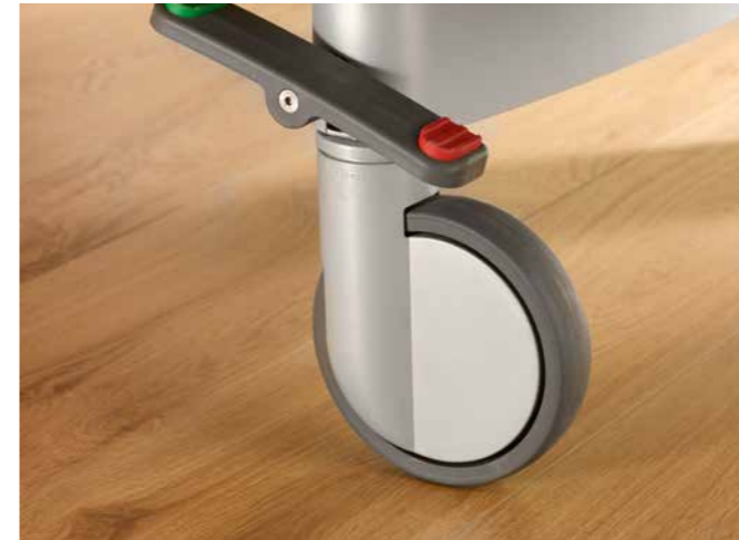
▲ Integral castors with central braking.