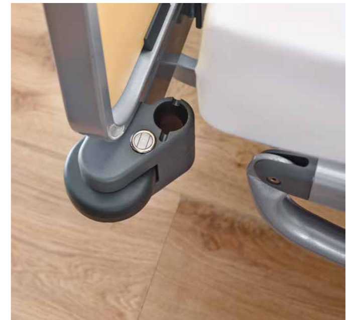
▲ A spirit level for the angle of tilt can be integrated into the wall deflection rollers at the foot end.