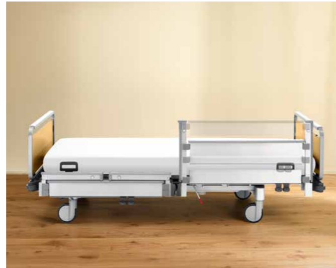
▲ The MultiFlex safety side has a protection height of 41.5 cm.