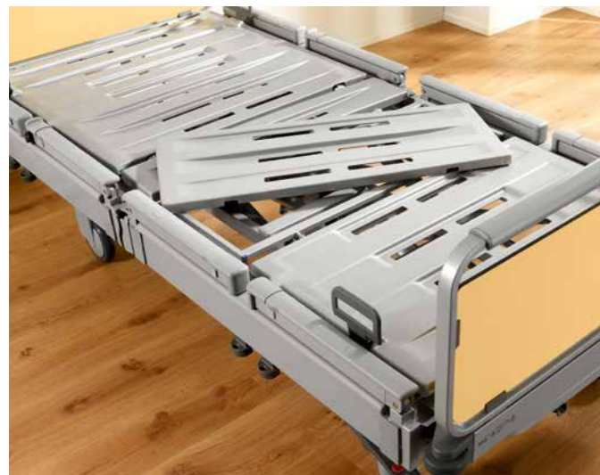
▲ The mattress base sections are extremely light and can be removed separately. This simplifies manual reprocessing.