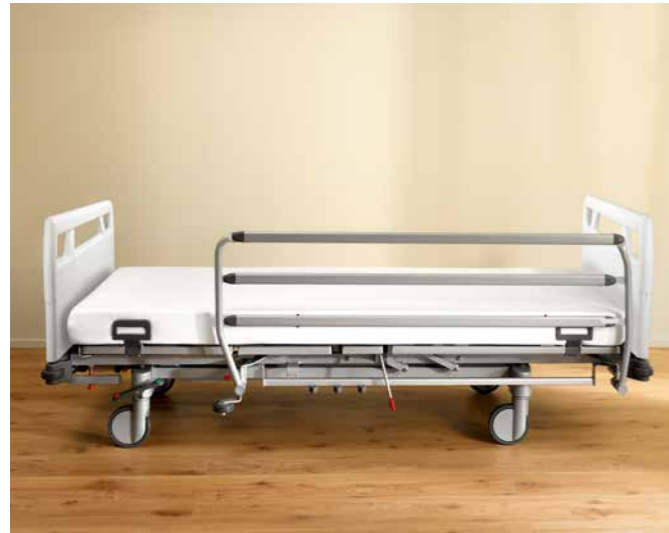
▲ The ¾ safety side with a height of 39 cm covers a large proportion of the mattress base and affords the patient an uninterrupted view.