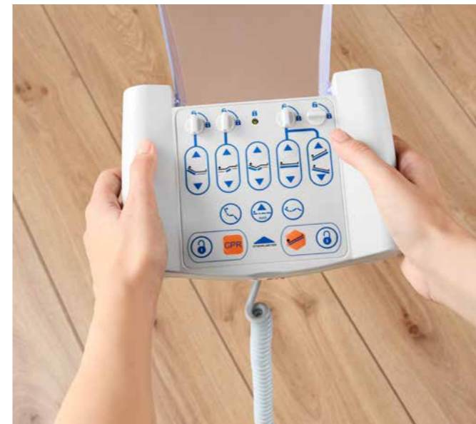
▲ With the control box, all the adjustments of the mattress base can be operated and functions can be locked for the patient.

The control box is integrated in the linen holder in the bed. There, it is protected but still easily accessible to care staff. In order to reach the control box even more quickly during the day-to-day routine it can be hooked onto the footboard of the bed.