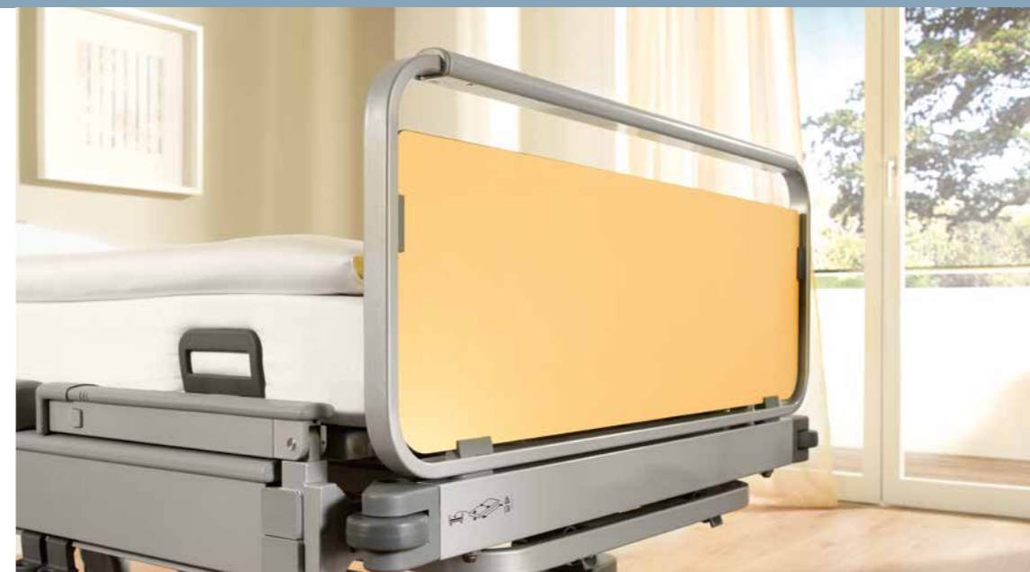
▲ The Classic headboard/footboard has a robust steel frame and a reinforced handle bar for transporting the bed.