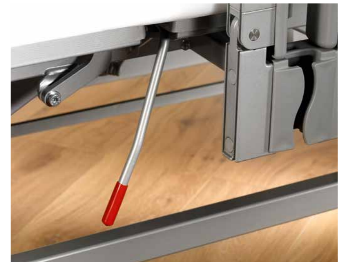
▲ The emergency lever allows the backrest to be lowered quickly and safely in one easy movement.