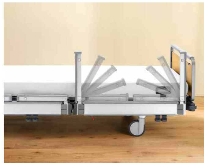
▲ The fold-down supports of the MultiFlex safety sides also serve as a mobilisation aid.