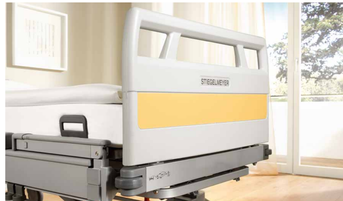
▲ The Intercontinental headboard/footboard is made of plastic and is particularly easy to clean.