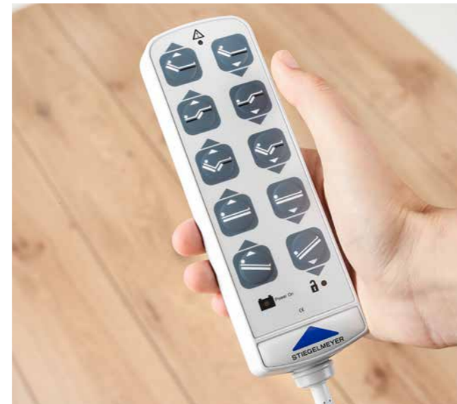
▲ The handset is lockable as standard and allows the Trendelenburg position to be set quickly in an emergency.