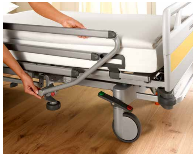
▲ The ¾ safety side can be effortlessly swivelled away in just a few easy steps.