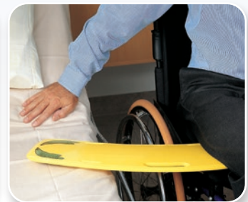
SAMARIT Nursing Aids

Download your language from our website or ask your local distributor.