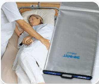
SAMARIT Rollbord Hightec