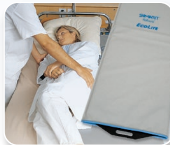
SAMARIT Rollbord ECOLite