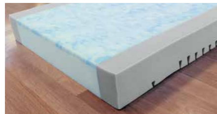
▲ Sky-fit model with high-quality Skytherm® top layer.

If people being cared for spend long periods in bed, original Burmeier mattresses offer an ideal combination of comfort and prevention. They are precisely tailored to the mattress base sections and accommodate every movement. When the backrest and thigh rest are adjusted, they therefore provide ideal pressure relief. The Sky-fit and Comfort-fit models are also reversible mattresses with one smooth side and one side with incisions. As a result, these mattresses are never "too hard" or "too soft" – they can simply be turned over and offer two different lying sensations.