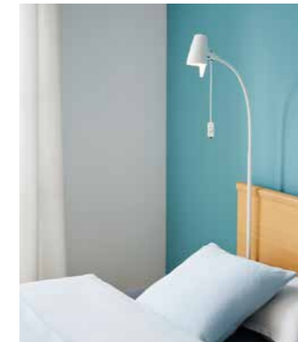
▲ Reading lamps can be inserted into the sleeve or attached to the patient lifting pole.