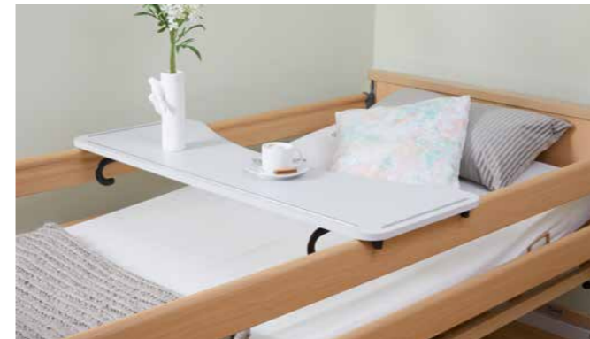
▲ The practical tray for enjoyable mealtimes.