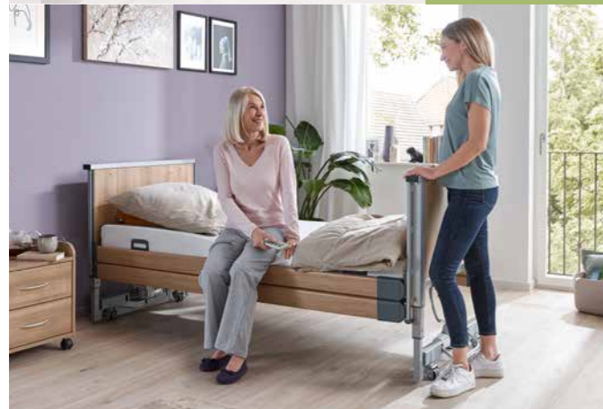
▲ During height adjustment, the bed makes an intermediate stop at the ideal position for standing up.