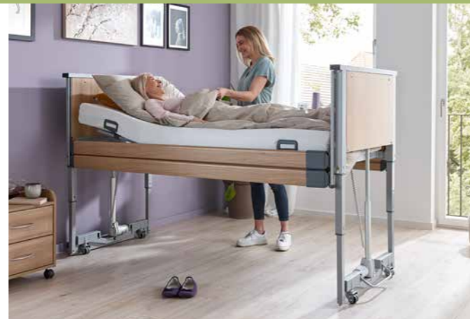
▲ A floor-level care bed with an ergonomic working height of 80 cm – this is one of the great strengths of the Lenus.

Even with floor-level care, the person being cared for needs to experience moments of eye-level contact – or carefully supported mobilisation. The Lenus provides ideal assistance here. During height adjustment, it makes an intermediate stop at 38 cm to allow the patient to get up effortlessly and ergonomically. This height can also be set individually depending on how tall the user is. At the maximum height of 80 cm, even tall carers can work in a back-friendly position .