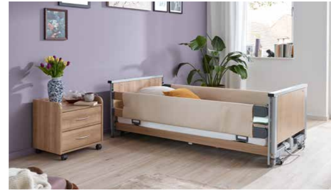
▲ Foam leather covers protect from knocking against the safety sides.