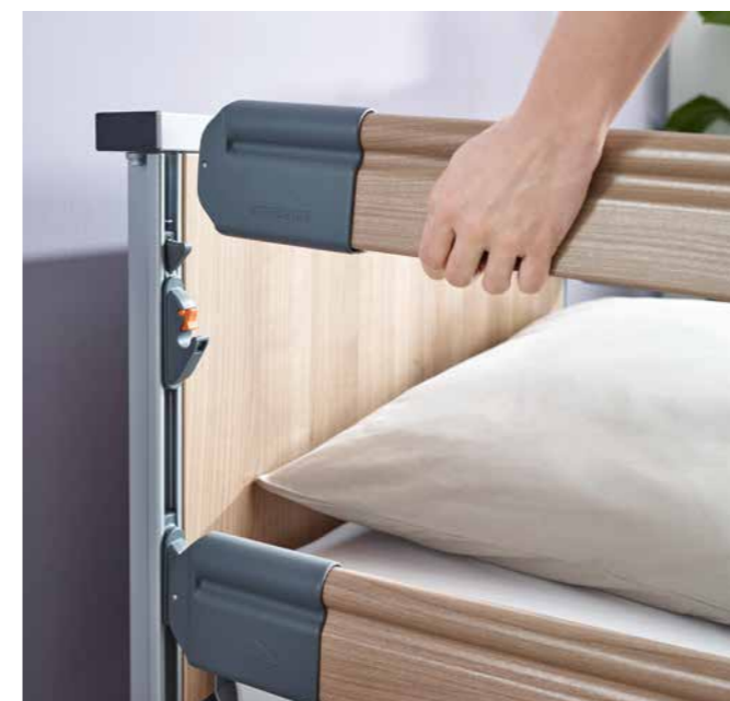
▲ The Easy Click system makes for easy and effortless assembly and dismantling.