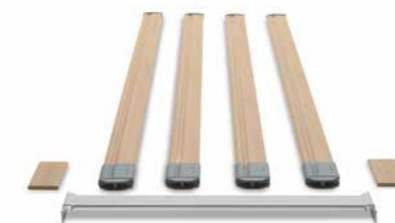
▲ The optional extension set allows ideal use of the integrated bed extension.

With original accessories from Burmeier, the Lenus can be transformed to a bed that leaves nothing to be desired. Already integrated is a pull-out extension of the bed frame by a length of 20 cm. To enable its use, an extension set with an additional mattress base section, plus longer safety side bars and infill pieces for the side panels, is available as an option. A perfect-fit mattress piece is also available for extending the mattress. A reading lamp and under bed light provide pleasant light and safe orientation at night. The optional foam leather cover protects restless users from knocking against the safety side. A practical tray for meals is simply placed on top of the safety side.