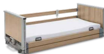
▲ Full-length safety sides (DSG)