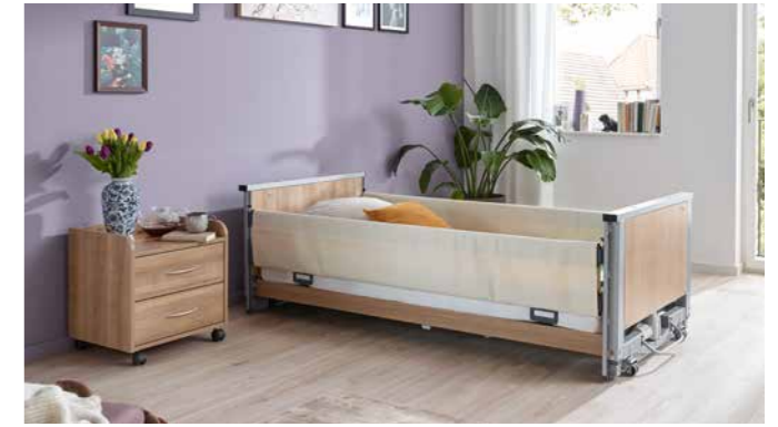
▲ Fabric Softcovers in attractive colours – here, in vanilla – encase the safety side.