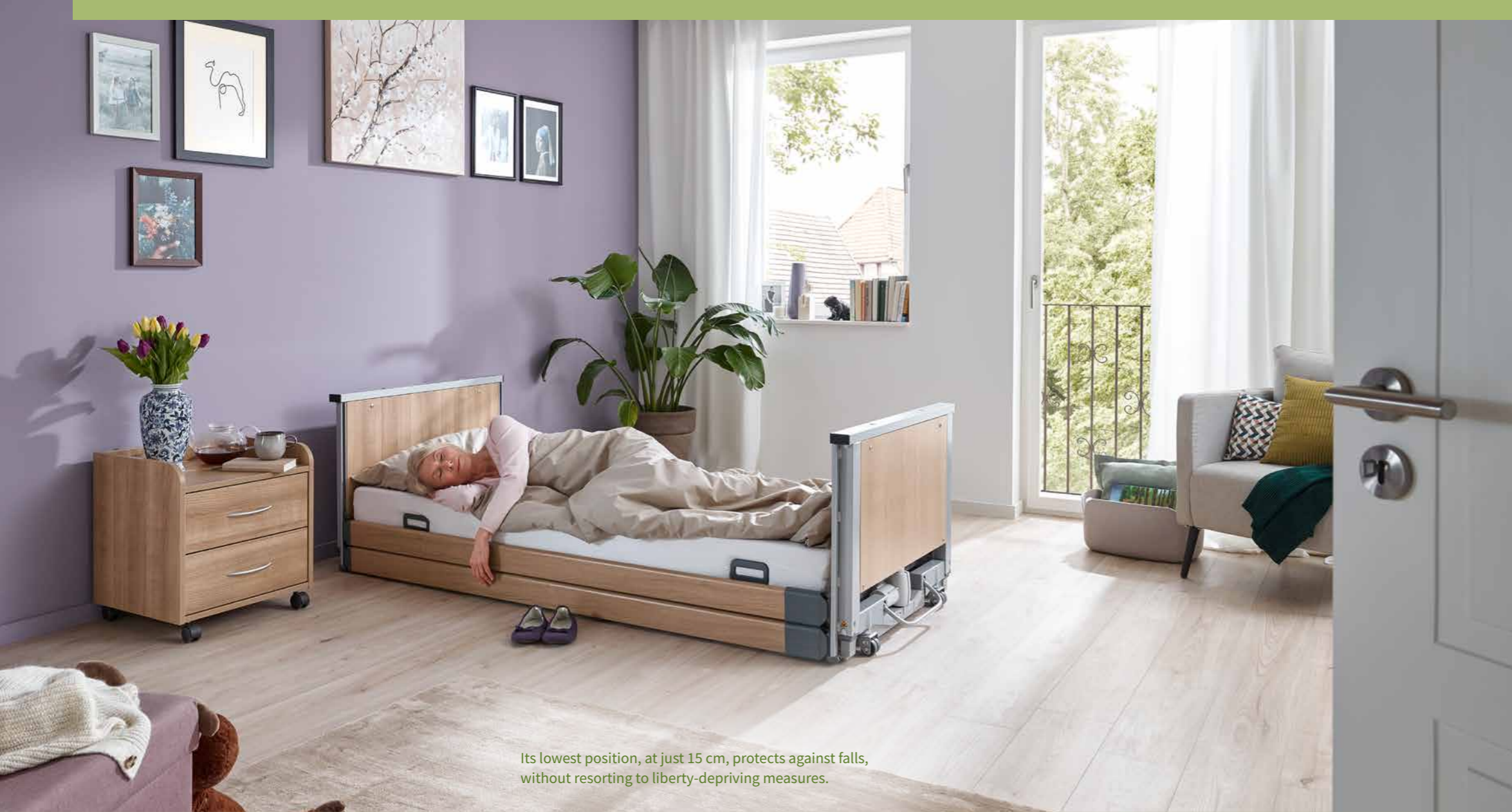
Its lowest position, at just 15 cm, protects against falls, without resorting to liberty-depriving measures.