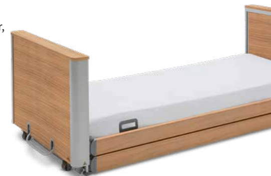
▲ Wooden surrounds attractively encase the headboard and footboard.

For maximum well-being, we recommend the comfort mattress base made of 50 free-floating spring elements.