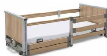
▲ Combinable split safety sides (KSE)

✓ = standard feature 0 = available as an option