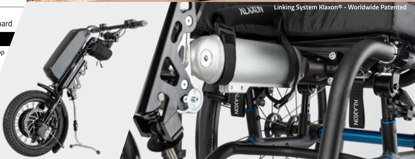
Linking System Klaxon® - Worldwide Patented

By pressing the green button on the new multi-function control panel you can set and maintain your favourite speed on both uphill and downhill. Ideal for your trips and everyday life!